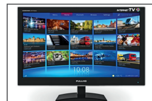
Wireless Internet TV